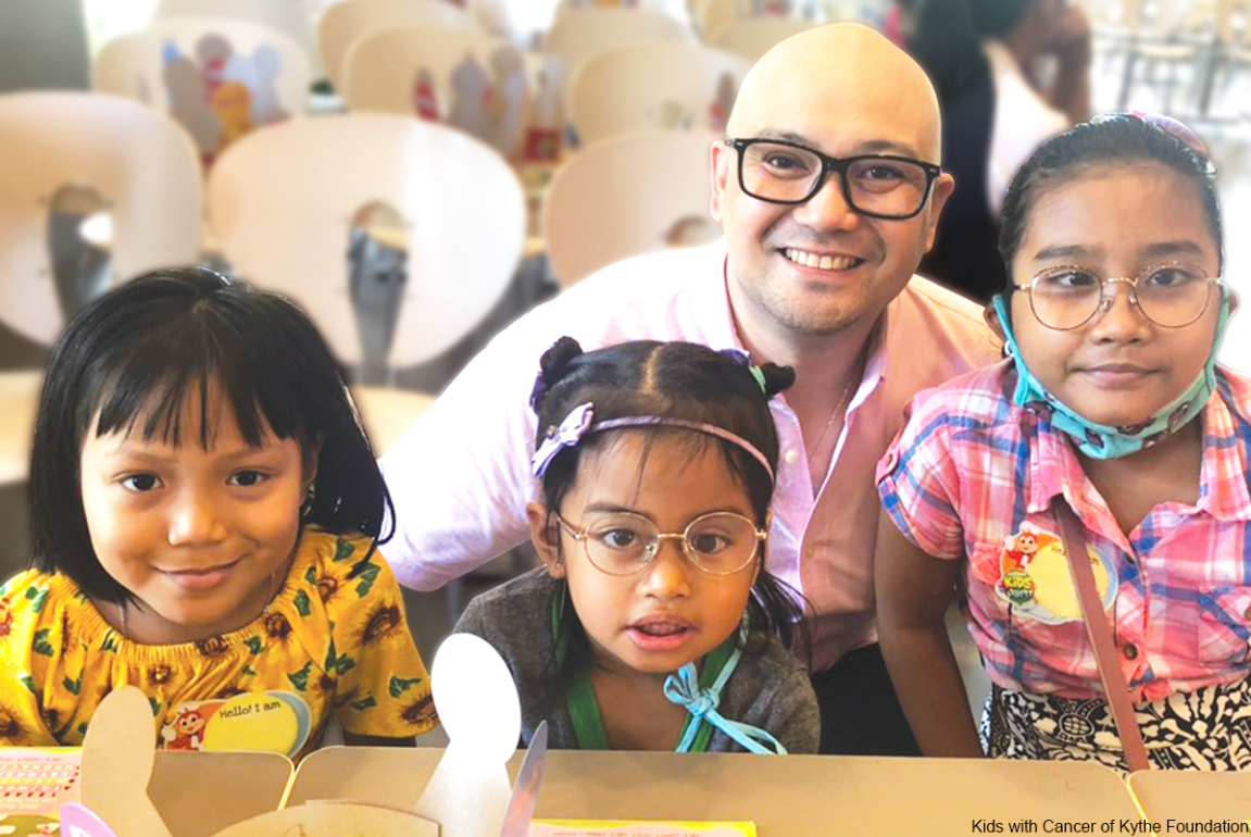
Kids with Cancer of Kytthe Foundation

OFFICIAL PUBLICATION OF ROTARY CLUB OF CEBU FUENTE DISTRICT 3860