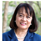
LUZ FILIPINAS SAN PEDRO Ways & Means